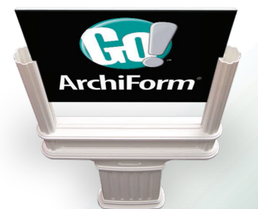
The ArchiForm slotted columns are distinctive and offer great versatility. Our 24" x 18" x 5" Ultra Plus™ signboard is high quality extruded polystyrene foam between two layers of 2mm expanded PVC Liner.