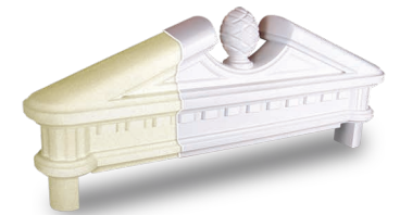
Solid urethane core adds strength and durability and gives ArchiForm a solid "wooden" feel.

ArchiForm is cost effective and delivers a premium quality look that "fence post" PVC just can't duplicate. Our elegantly styled component system was designed with sophisticated CAD technology to produce parts that fit together with strength and precision. And the best part is that it only takes minutes, not hours, to assemble and install. ArchiForm signs are designed with incredible detail and architectural flair that will make your location stand out from the crowd. Typical ArchiForm applications include: real estate developments, retail stores, professional offices, restaurants, bed and breakfast homes, historical sites, and more!