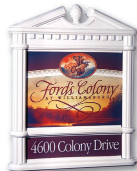
AFG-1824 ArchiForm Gabled Sign Suggested Retail $395 Includes: 24" x 24" sign blank and a 21" x 6" strip sign Banner Size: 36" x 30" x 5" Weight: 14 lbs. Ship/Dim Wt. 34 lbs.

urethane core adds superior strength and durability. Utility. With ArchiForm, changing sign boards is a snap, because the decorative top section is removable! Our "fluted column" style posts are both elegant and durable. Also, our modular design lets you add multiple strip signs to our hanging version. We have the sign you need to best suit your space and size requirements! For complete specifications and configuration possibilities, contact your authorized EXPOGO dealer today!